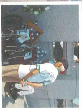
"We can't all be heroes. Some of us have to stand on the curb and clap as they go by." - Will Rogers

The mission of the Honor Flight Network is to fly America's veterans to Washington, D.C. to visit those memorials dedicated to honor their sacrifices. Top priority is given to America's most senior veterans – survivors of WWII and any veterans